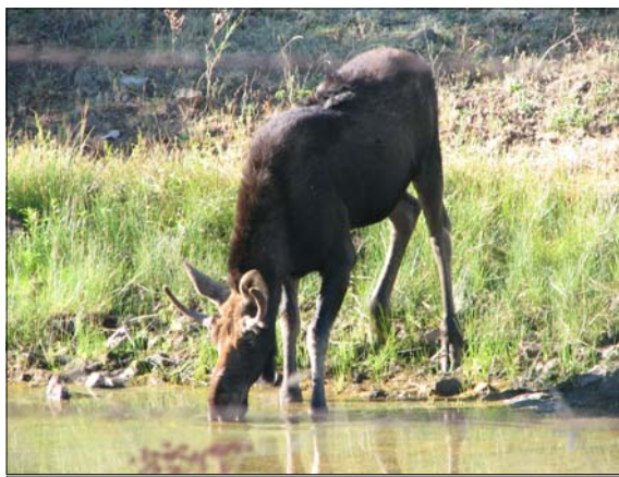
Free Use Moose

For a long time I've been curious about one of White Bird's major thoroughfares: Free Use Road. Just the name can get you thinking. Finally, I got curious enough to ask. Only got a spotty history and ran out of time, but I'll research the matter and put a piece about Free Use Road's history in the March issue. I welcome any local knowledge or stories about it that you can contribute. TCC, 839-2625.