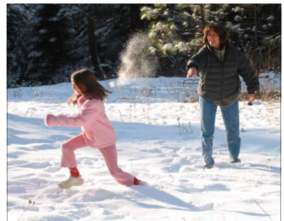
Free Use Fun