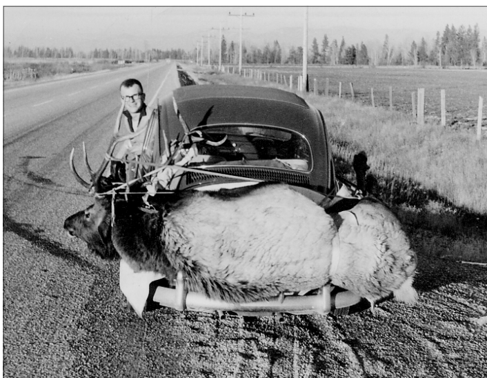
Bull on a Beetle. Darby, Montana, 1962

I drew a late season cow tag this year. It made me think about hunting bucks and bulls, which I usually did back in the day.